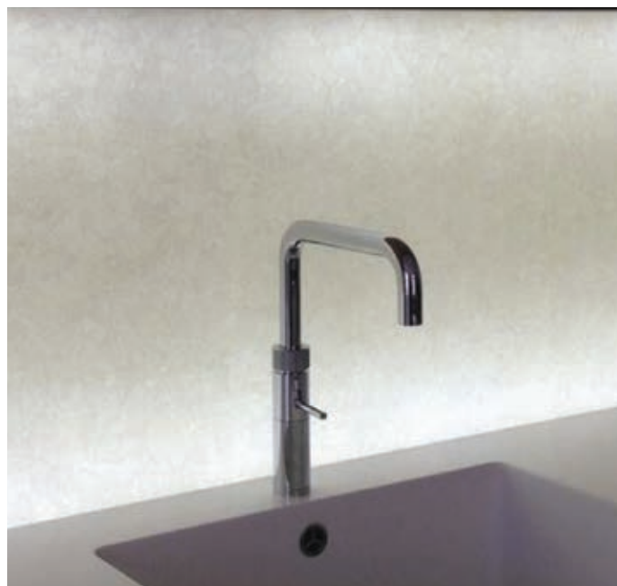
FUSION ICEBERG WITH COOL LIGHT