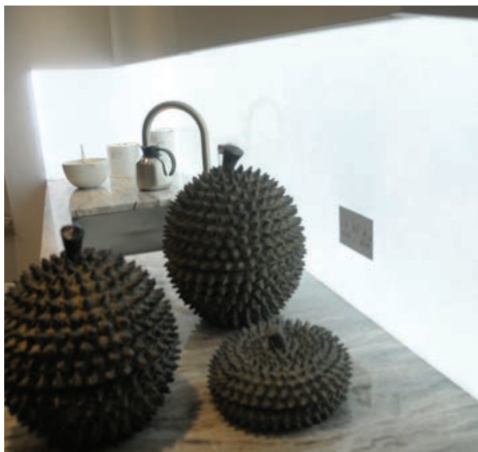
ICEBERG WITH COOL LIGHT

Using the latest LED technology, DecoGlow delivers unique lighting solutions for 6mm Graphic Glaze and Fusion Iceberg panels in warm, cool white, or colour changing light.